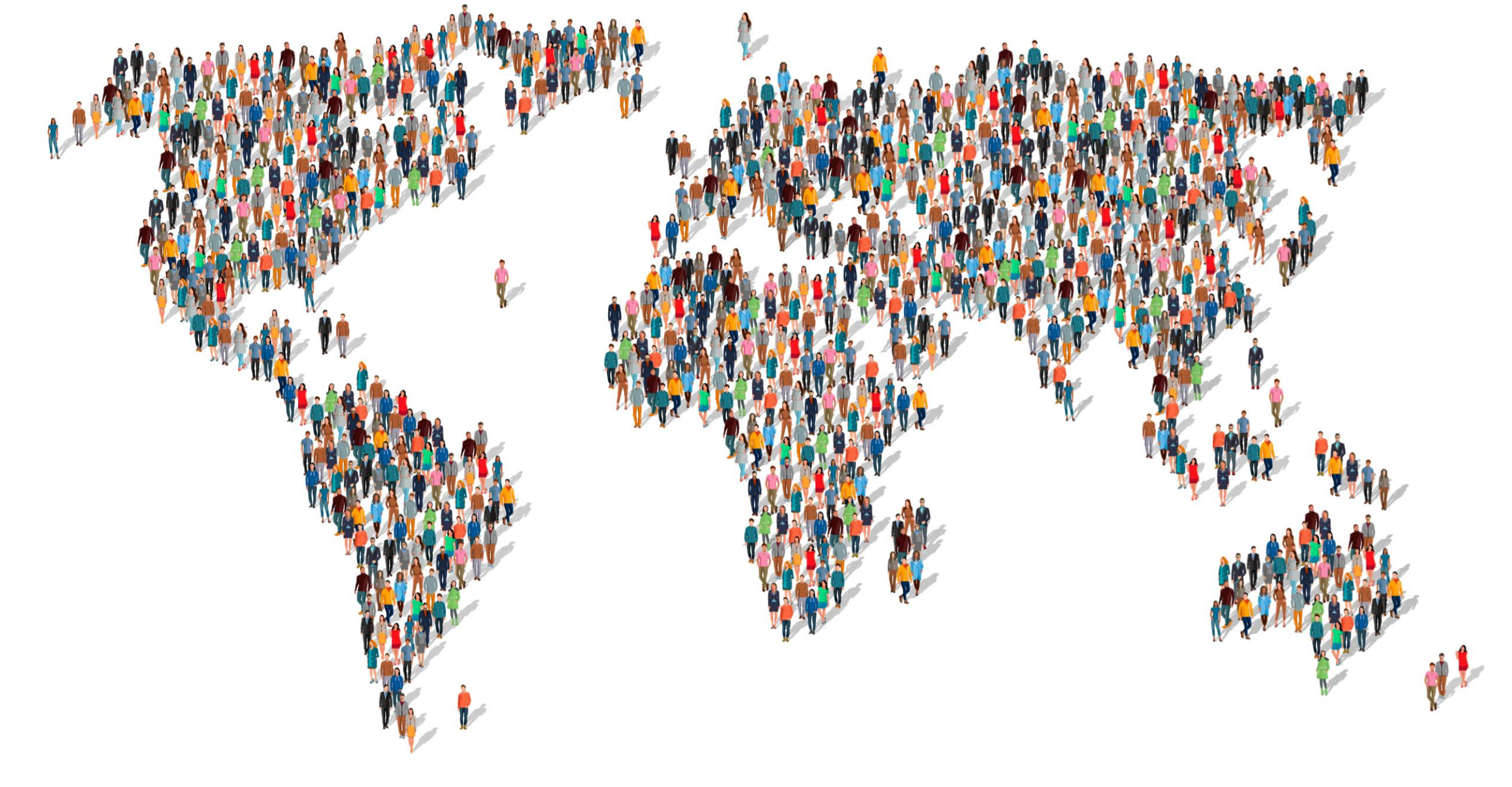
This is the world we live in.